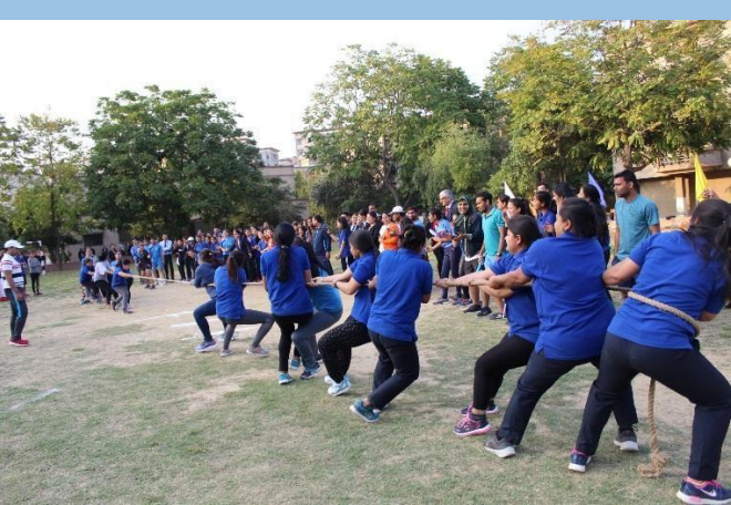
Exhibiting strength during Tug of War