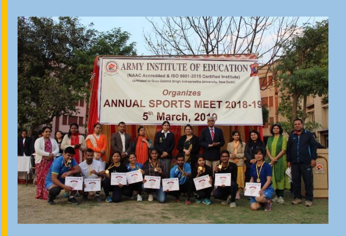
Winners with their Medals and Certificates