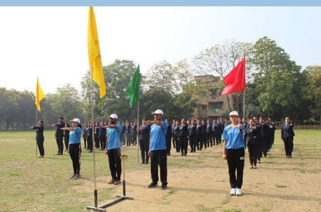
Oath Taking Ceremony