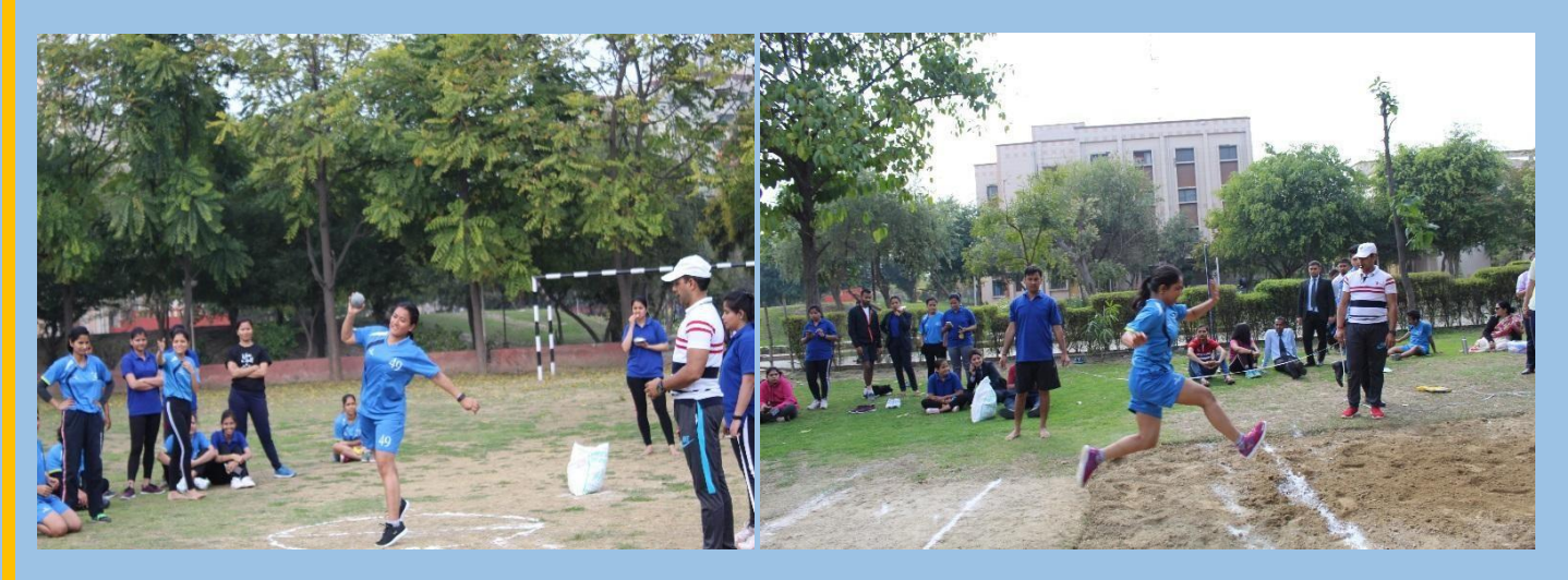
In action during Shot Put