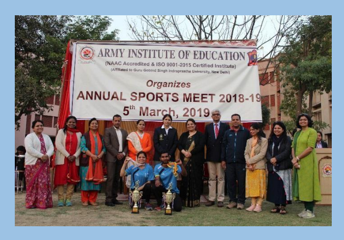
Best Sportspersons with dignitaries