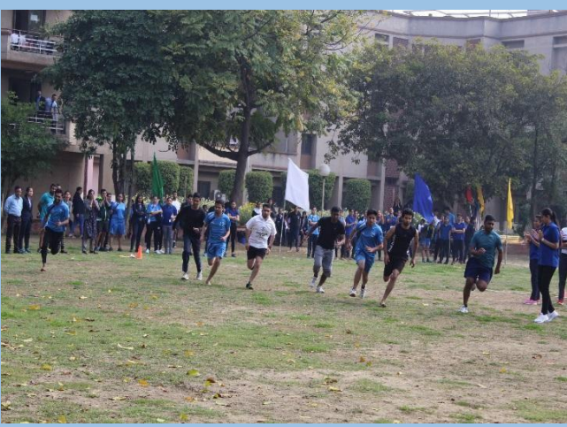
Students during Race